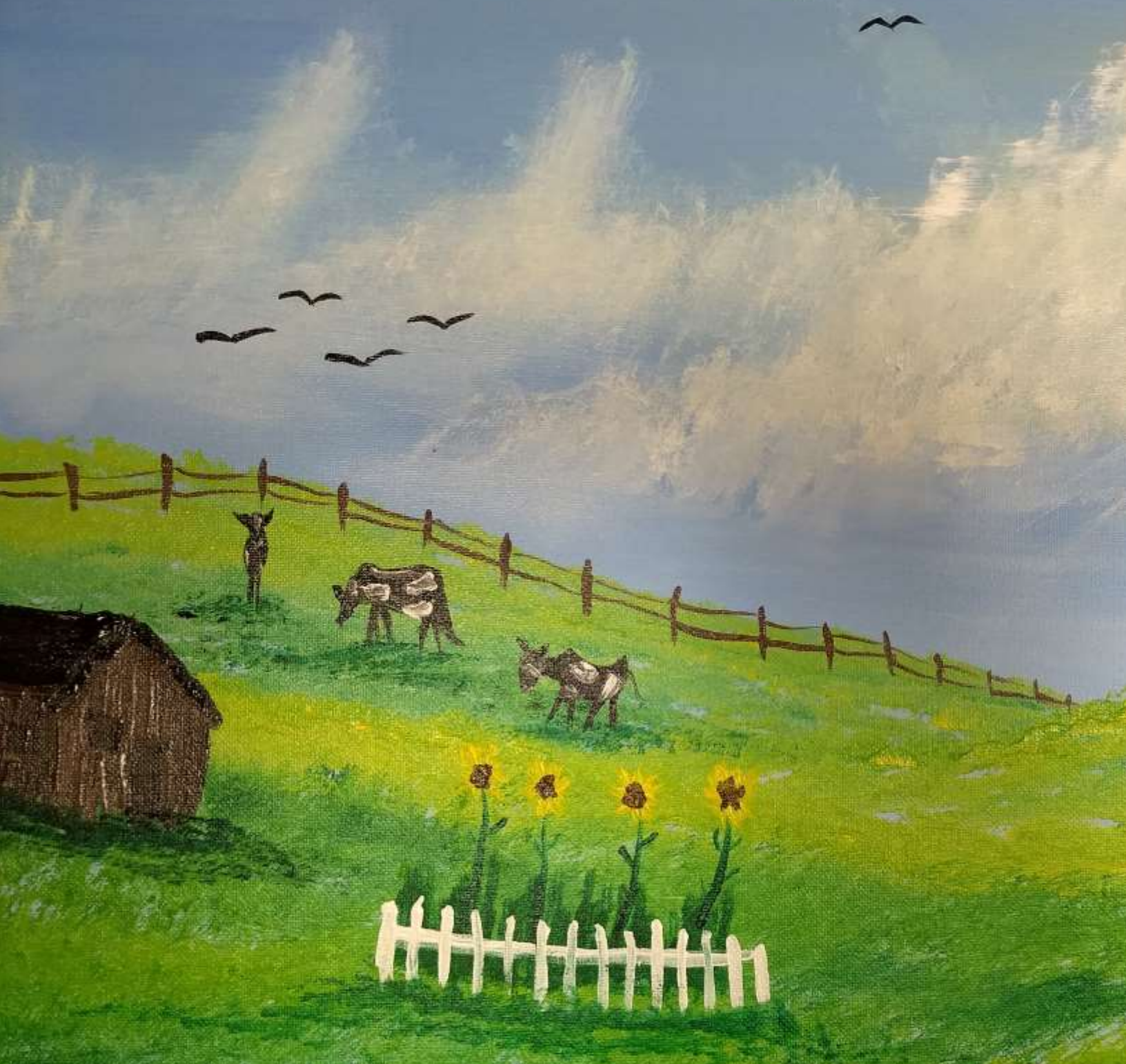
“The old farm in St. Charles”