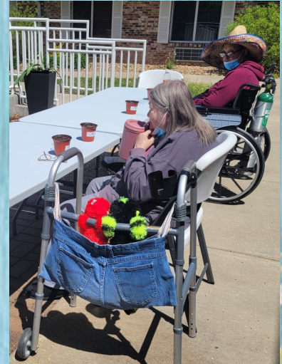
A big thank you to Terrace Home Health for bringing 3 delicious cakes for our monthly Resident Birthday Party!