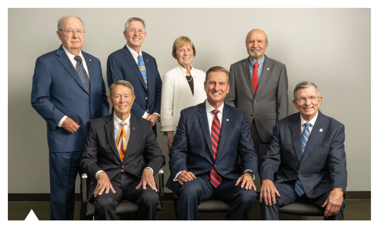
NHC Board of Directors