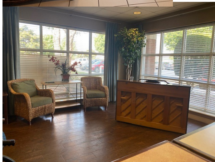
Rehab-Unit 3 Dining Area got a Piano for Live Entertainers