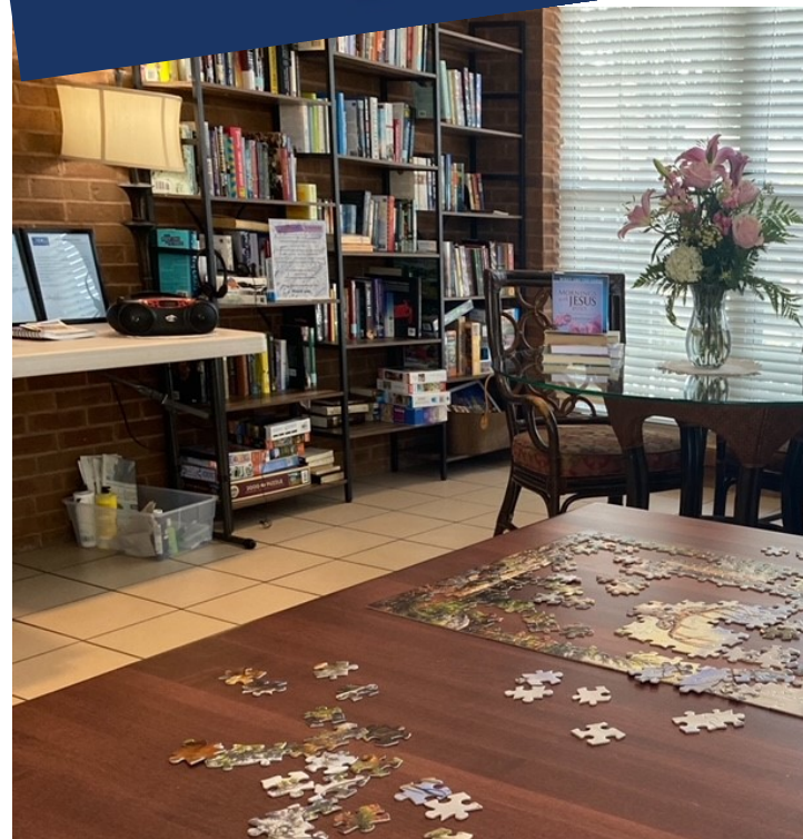
Newly Installed Library/Reading Room at Unit 2/ Activity Room