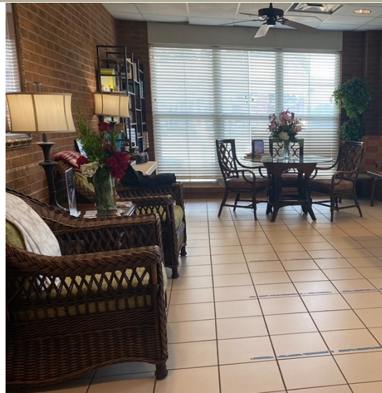
Unit 3 New Library.