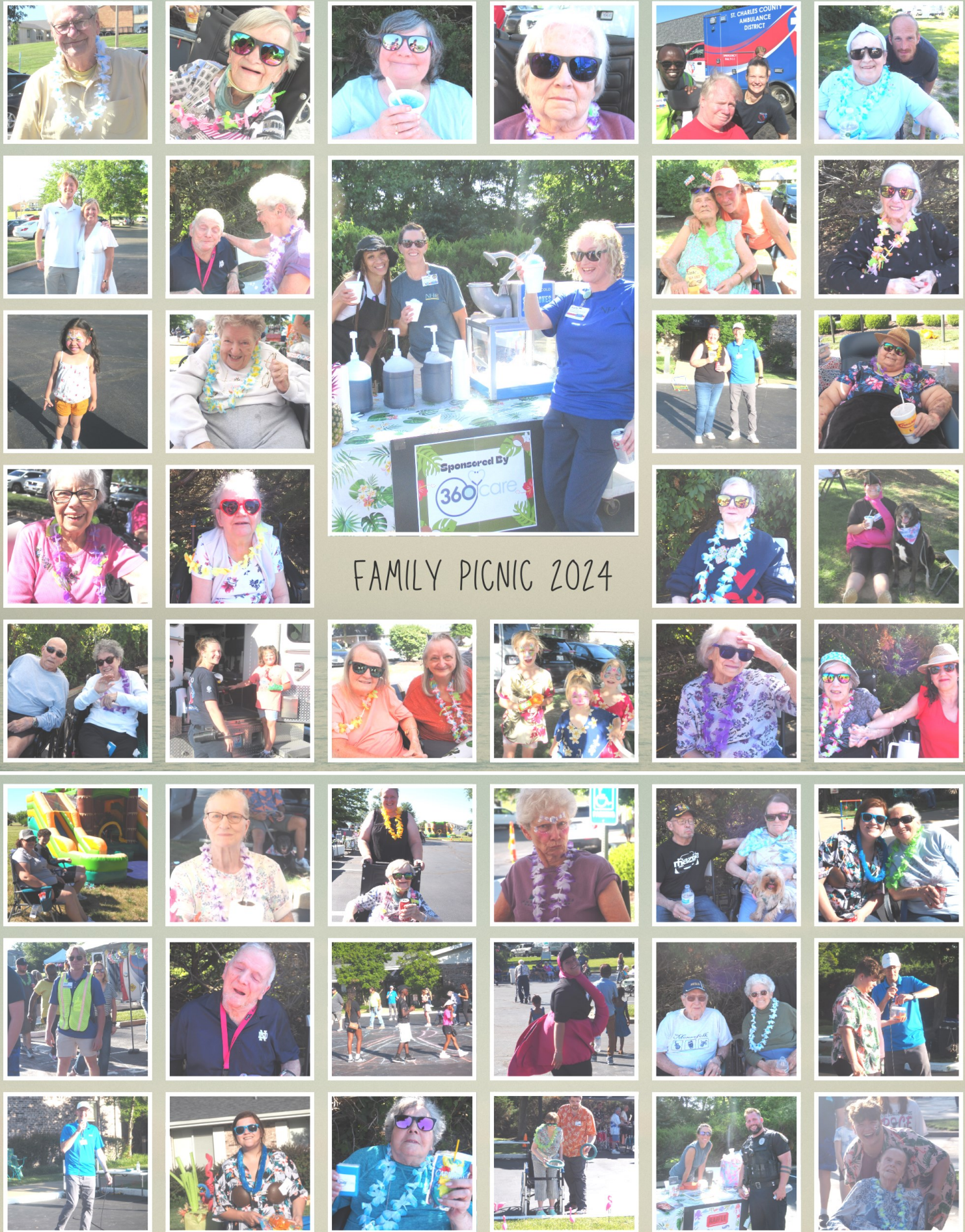
FAMILY PICNIC 2024