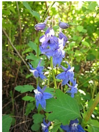
Blue Delphinium (larkspur)

is a means of cryptological communication through the use or arrangement of flowers. Meaning has been attributed to flowers for thousands of years, and some form of floriography has been practiced in traditional cultures throughout Europe, Asia, and Africa.