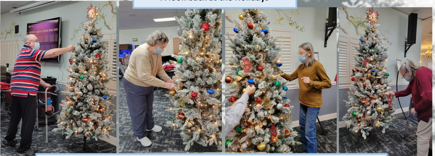
Kicking off the Holiday Season with decorating the residents Christmas tree!