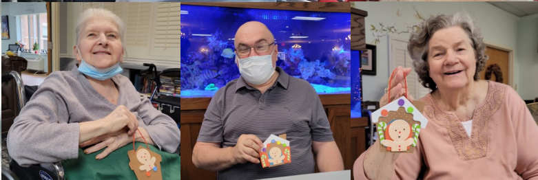
Plenty of Holiday crafting making décor and necklaces.