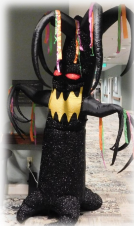
Residents fill candy buckets in preparation for trick-or-treaters